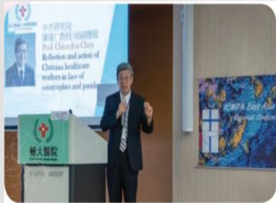
前副總統陳建仁教授演講

- CJ CHEN, FORMER TAIWAN VICE PRESIDENT, AS KEYNOTE SPEAKER FOR CHRISTIAN REFLECTION AMID COVID-19 PANDEMICS