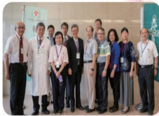
TCMA代表與陳前副總統、輔醫王水深院長合影