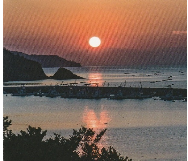
Photo: Sunset on the beach of Kyubuhama, Oshika peninsula in Miyagi prefecture

This time, we will hold the 47 th meeting at Matsushima, Miyagi prefecture, and also pre-conference (fieldwork for students) in advance. The purpose of this meeting looks for studying the affect and recovery from the great east japan earthquake disaster hit on this area and for preparing to next disasters.